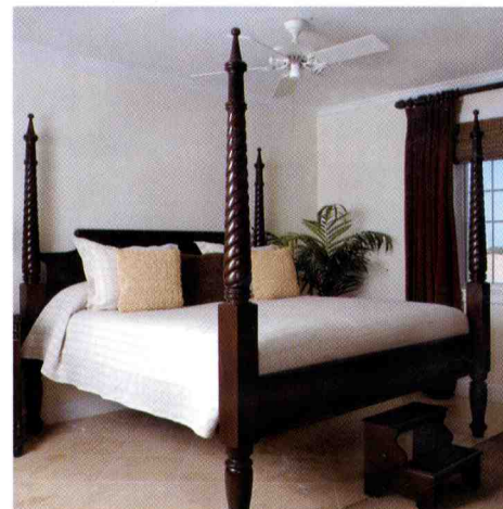
Every room in the resort is tastefully decorated.

Accommodations: 28 one-, two- and three-bedroom beachfront villas and eight poolside cottages.